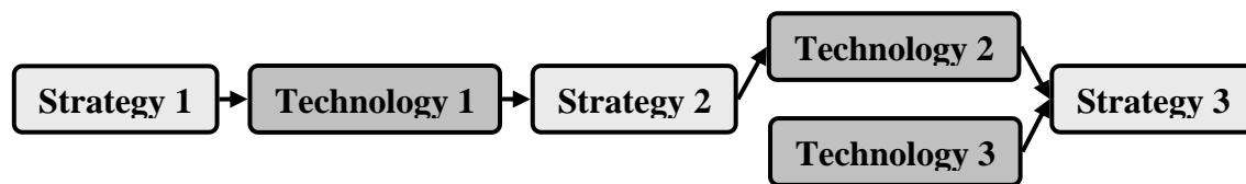
Exhibit 6. The Dynamic Interaction Between IT and Strategy